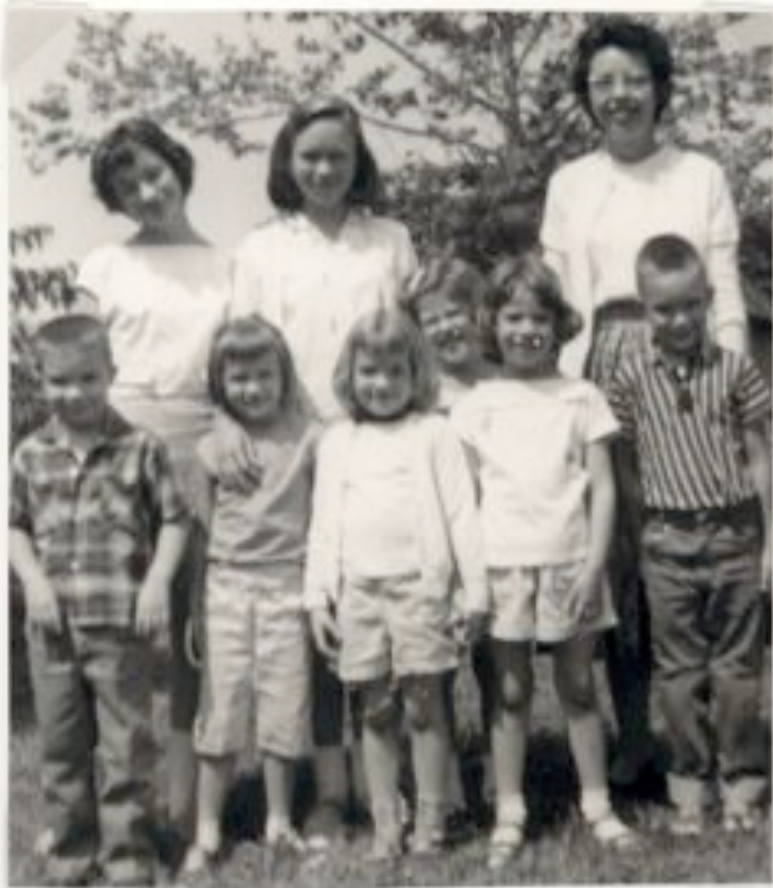
First Bible School